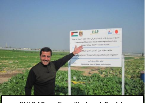
EVAPs' Demo Farm Signboard, Bardala