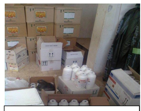
F. Inputs Procured by bulk Procurement method