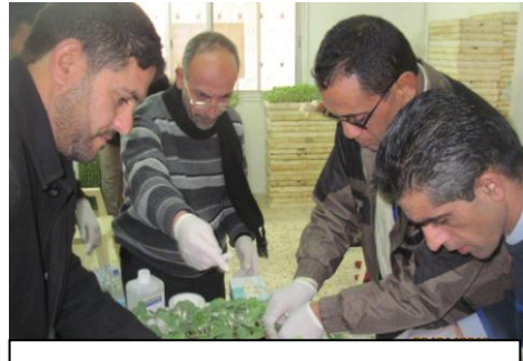
Practical Training on Grafting Techniques- Jericho