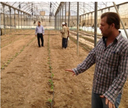
Demonstration of using composts- Jericho Agriculture Station.