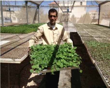
Grafted seedlings in the nurseries