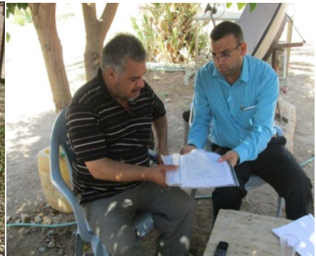
Submitting the translated action plan for a compost maker –Jeftlik