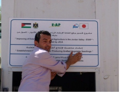
Signage of an incubator for the grafted seedlings-Bardallah