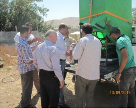
Receiving and distributing vegetable seedlings-Froosh Biet Dajan