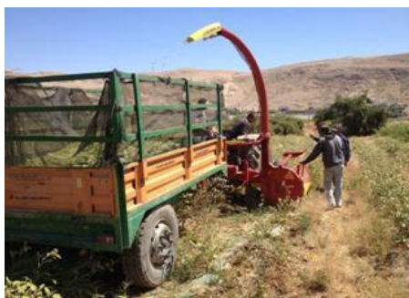
Field day around silage making in Al-Jeftlik