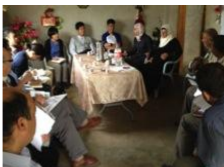
Action plan meeting in Al-Nawaji cooperative