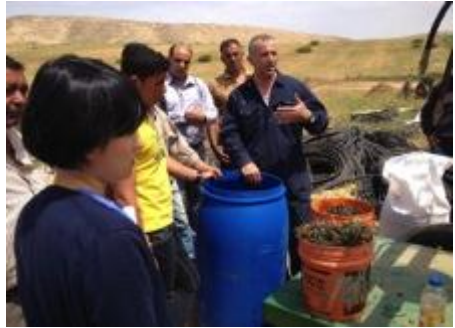
Field day about silage making