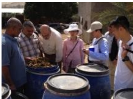
Silage farmer visit –Al –Jeftlik