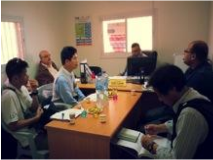
Interview with the head of Al-Jeftlik -Final Evaluation